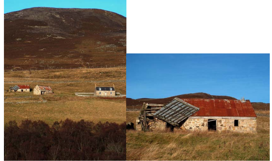
Fig 2. Auchtavan Cottage and Horse Mill. Fig 3 Auchtavan Cottage